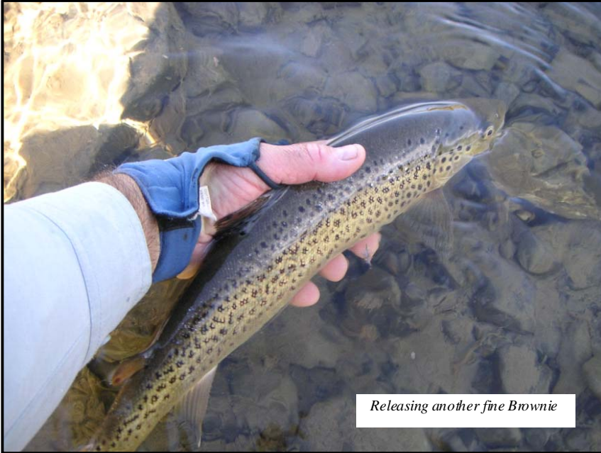
Releasing another fine Brownie

Moving on to the Crooked River a clear blue coloured stream, nice runs, again fish about the three pound mark but I can say I was broken off by a 10lb fish in this river. There he was sitting over a rock which was about 1 metre in diameter and he covered the rock so you guess, the only problem was the climb down the 5m embankment over the very large rocks and if I was lucky enough to hook him how will I land him, you guess it I hooked up and within 5